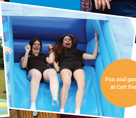
Fun and games at Cott Fest