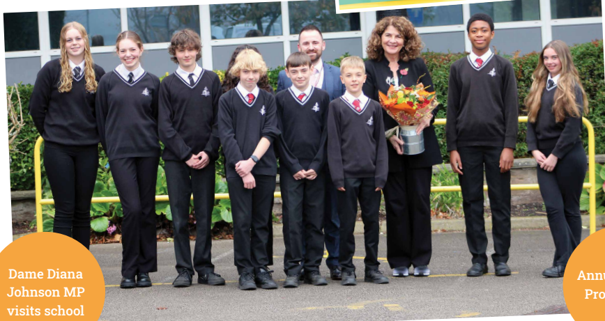
Dame Diana Johnson MP visits school