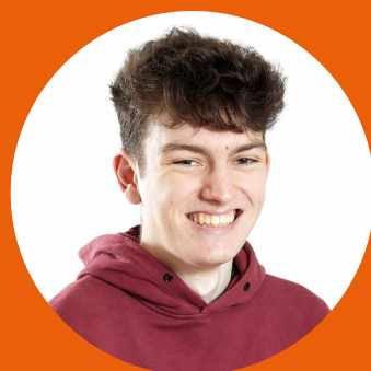
Finlay Hessle Campus

I plan to go to university to continue my studies.