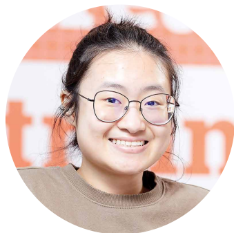
Anabelle Cottingham Campus